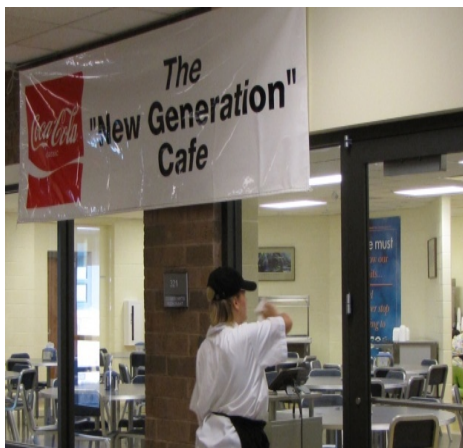
Basic food service 12