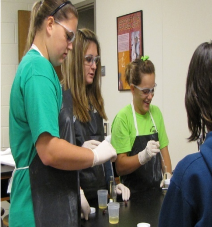
Patient Care Technician 11