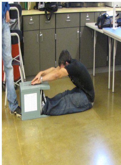
Public Safety 11