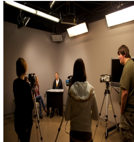
(ITIM)/(ITAP) Information Technology/Interactive Media