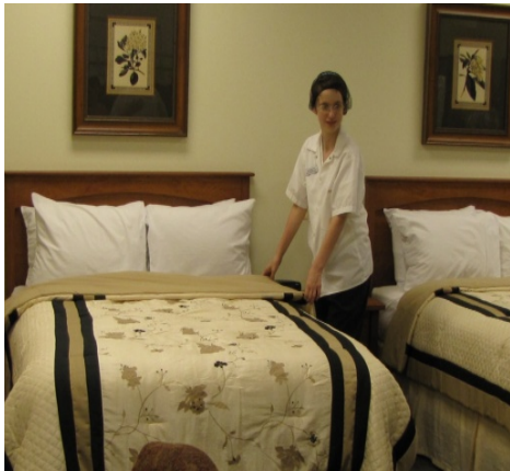
Hospitality and Facility Care 11