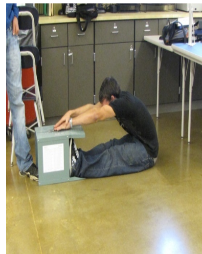
Public Safety 12