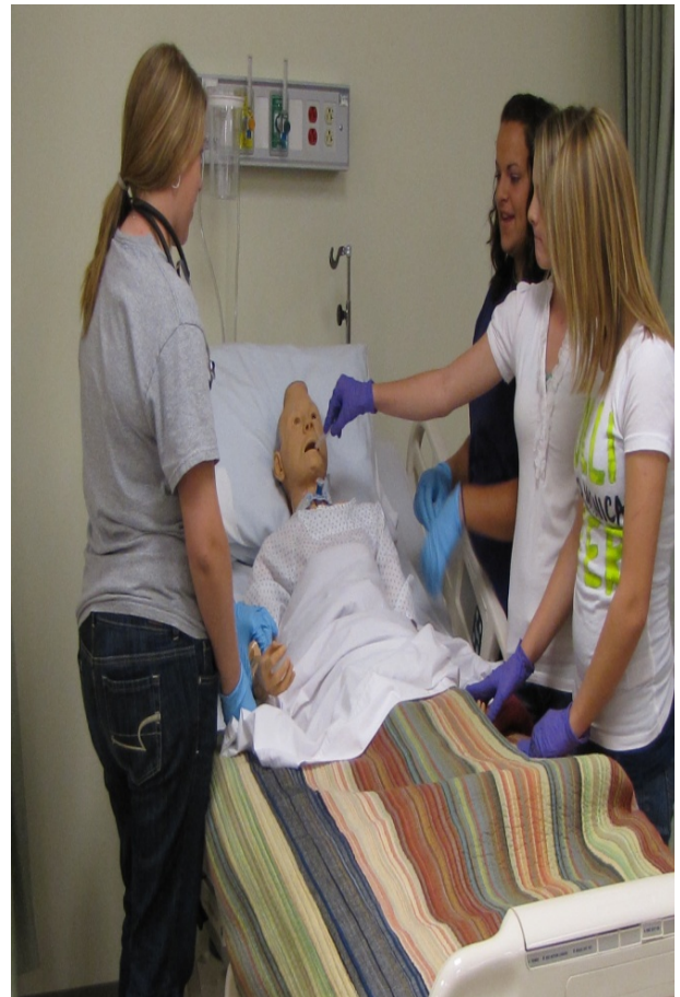
Patient Care Technician 12