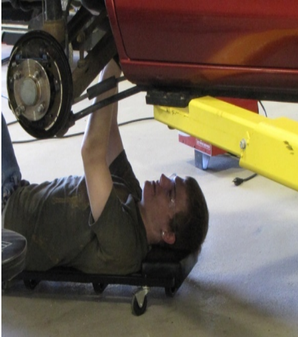
Automotive 11 & 12