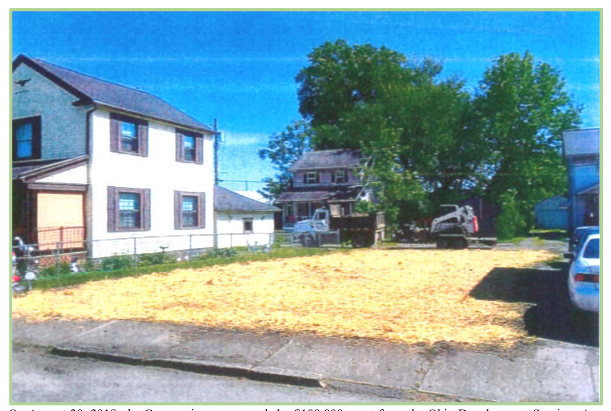
On August 20, 2018, the Corporation was awarded a $100,000 grant from the Ohio Development Services Agency (ODSA) to clean up an abandoned gas station located at 1652 Whipple Avenue NW in Canton Township.

The property was developed as a gas station and operated as such until 2008, when operations ceased, and has since been vacant. In 2016, a U.S. Environmental Protection Agency (EPA) Brownfield Assessment Grant was utilized to conduct property assessments of the site. These assessments identified asbestos in the existing structure, four (4) underground storage tanks, and limited amounts of chemicals of concern in the soil. Of the issues identified, the RPC removed the 4 tanks from the property with funds from a previous EPA grant; the other identified issues were not funding-eligible activities through that grant.