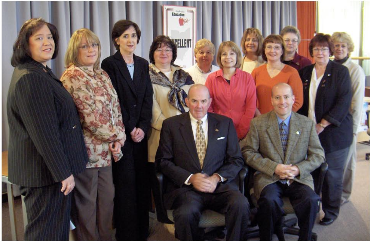
Mentor Public Schools Treasurer's Office