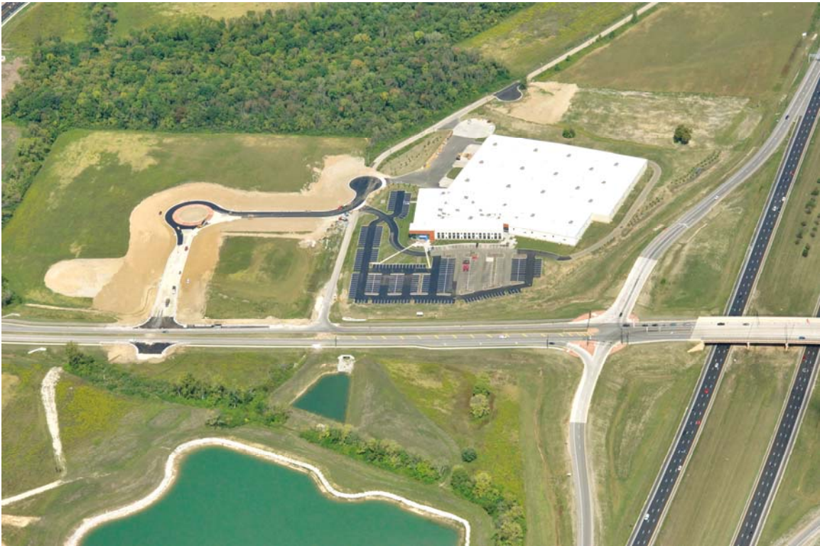
Motoman project with the connector road to the west of the Austin Interchange