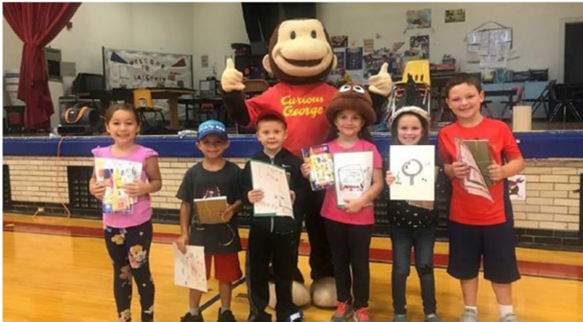
Reading Counts Assembly—Hebron Elementary

Lakewood Local School District Hebron, Ohio