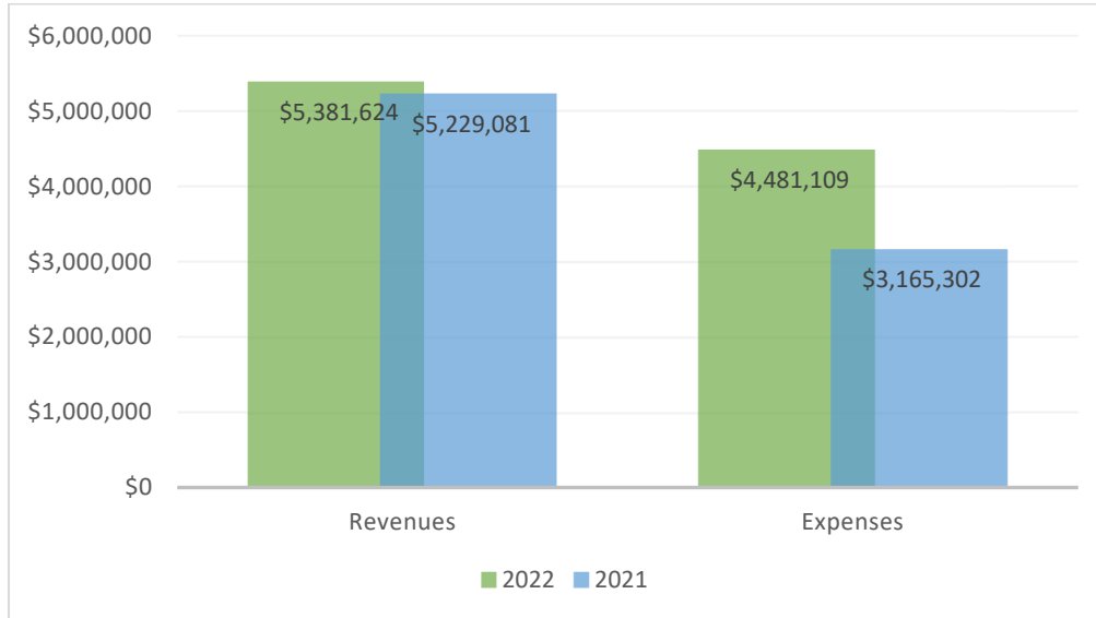
Revenues and Expenses December 31, 2022 and December 31, 2021

Revenues of $5,381,624 exceeded expenses of $4,481,109. The graphs below compare the Council’s activities revenue and expenses for the years ended December 31, 2022 and December 31, 2021.