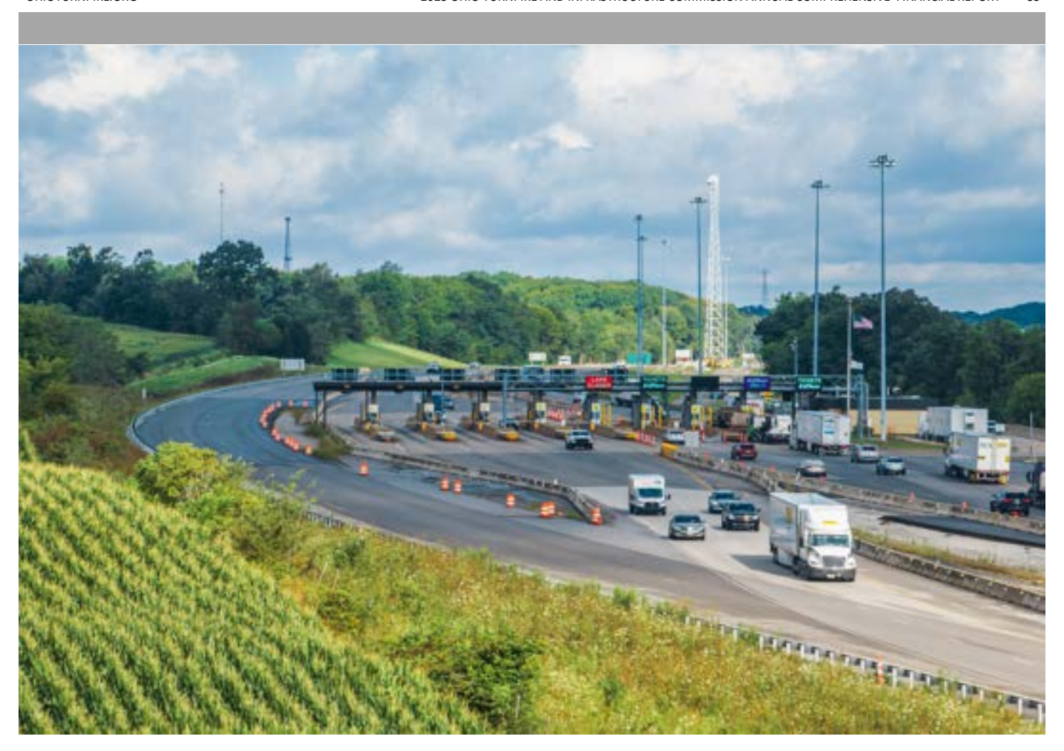
Ohio Turnpike and Infrastructure Commission