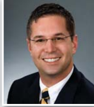
Mayor Timothy DeGeeter