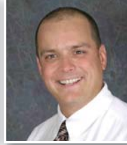
Mayor Jack Bacci