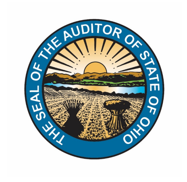
Certified for Release 8/11/2020

This is a true and correct copy of the report, which is required to be filed pursuant to Section 117.26, Revised Code, and which is filed in the Office of the Ohio Auditor of State in Columbus, Ohio.