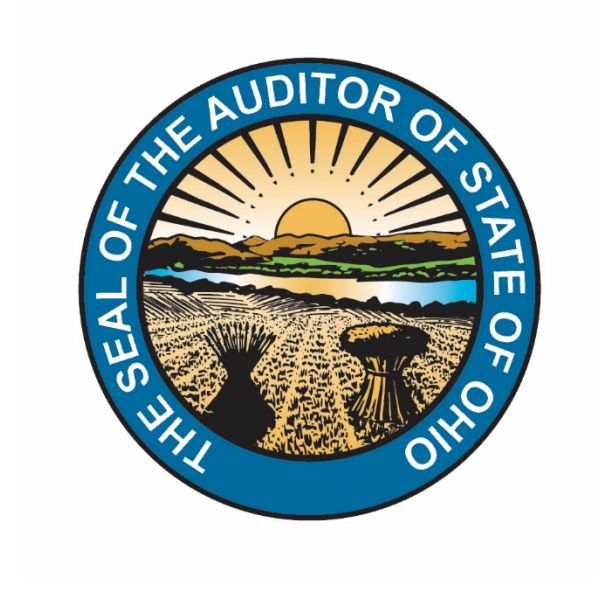
Certified for Release 8/6/2020

This is a true and correct copy of the report, which is required to be filed pursuant to Section 117.26, Revised Code, and which is filed in the Office of the Ohio Auditor of State in Columbus, Ohio.