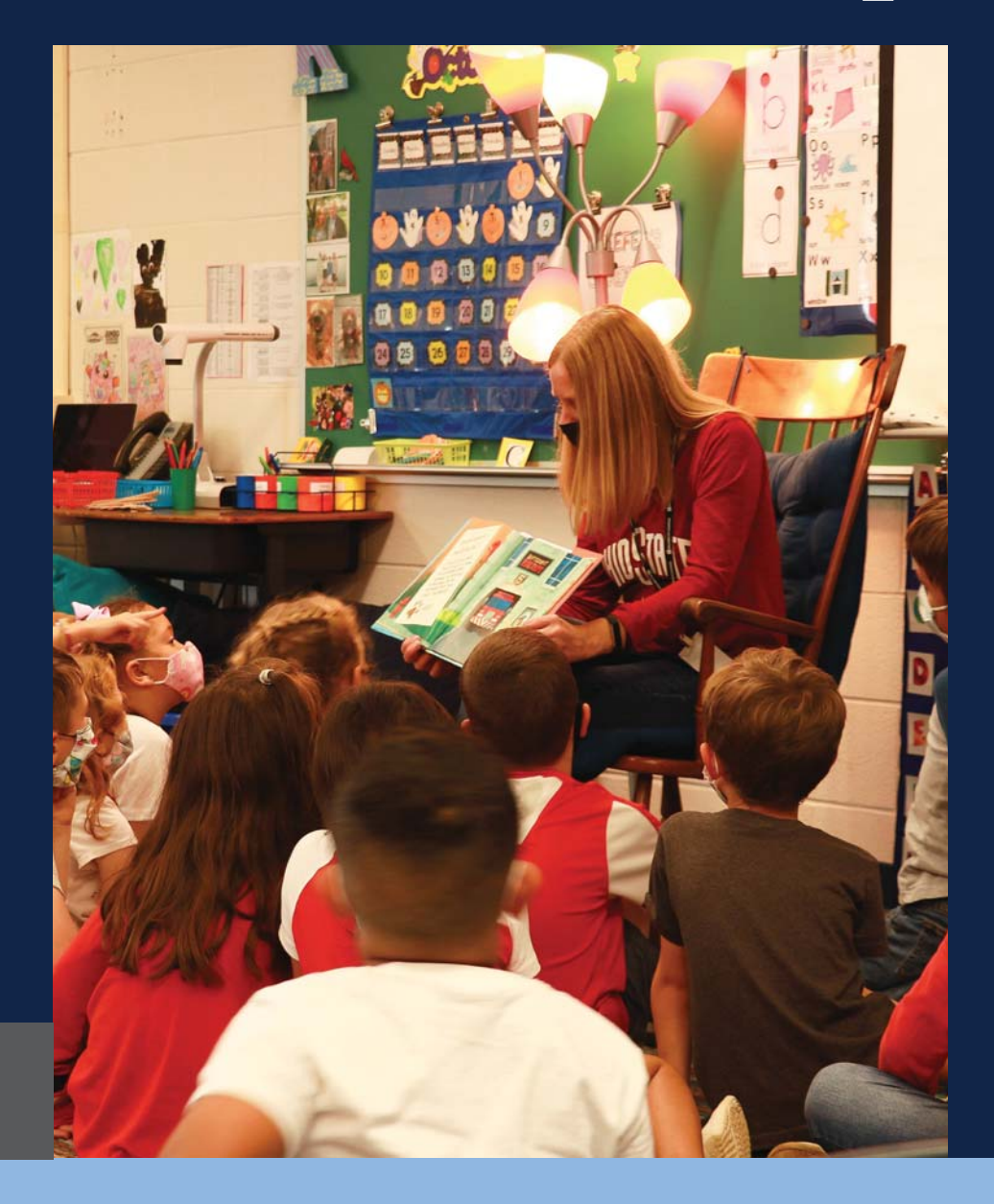
HILLIARD CITY SCHOOLS