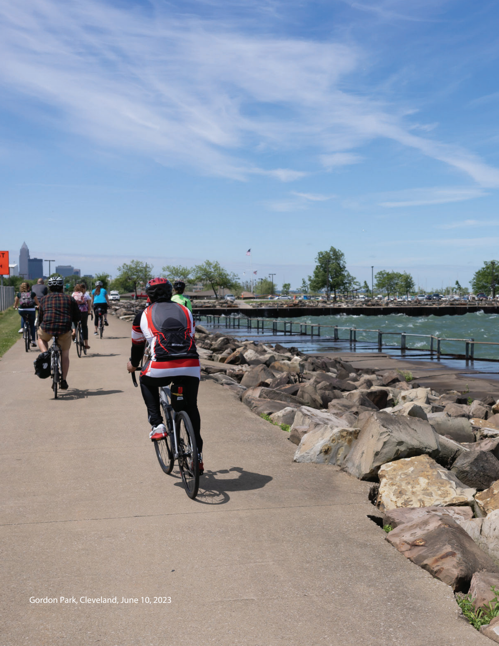
Gordon Park, Cleveland, June 10, 2023